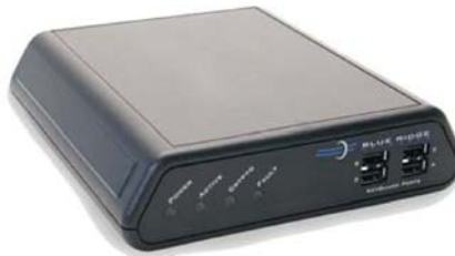
RemoteLink is a zero configuration device.

RemoteLink is the first true plug-and-play device that works with any communication medium to secure all Ethernet-enabled devices to the rest of the enterprise. Its simple approach to secure connectivity allows data, VoIP, and video to be carried securely over any public or private network - eliminating dependence on multiple carriers and the pain of dealing with wide area network protocols.